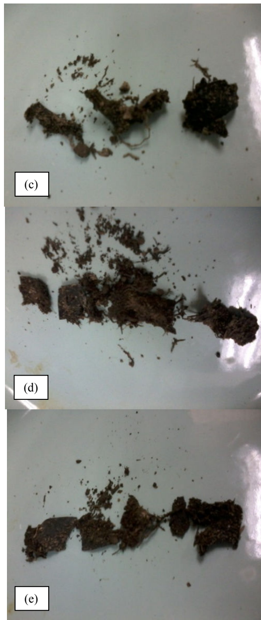
Fig. 3 Image of degraded hybrid films after 60 days of soil exposure (a) polybag 20%, (b) polybag 30%, (c) polybag 40%, (d) polybag 50%, (e) polybag 60%,