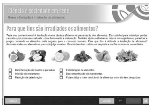
Fig. 3 Interactive exercises to check public's previous knowledge