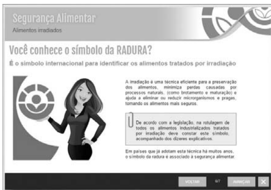
Fig. 2 Informing the general public: concepts about food irradiation

visitor. According to the equipment and resolution of the screens, the layout automatically adjusts for best viewing and better use of educational resources designed for the transmission of each content, as seen in Fig. 4.