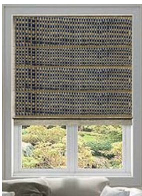
Fig. 22 Organic Gaddi wool used as window blind

The interior furnishings made out of the natural wool can also be used for wellness purposes.