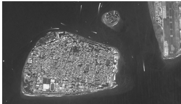
Fig. 1 Malé in relation to the international airport [29]

The local population of 341,000 resides on 188 islands, administered as seven provinces [28]. To minimize developmental challenges and economic cost associated with dispersed population, the government at times has carried relocation programs, which is highly unpopular among locals. For easy access to higher education, improved health and other welfare, over 39% of local population reside in the capital island Malé. Further, a large number of expatriates and a transient local population from outer atolls reside in Malé, an island approximately 2 km 2 (Fig. 1), making it one of the densely populated capitals.