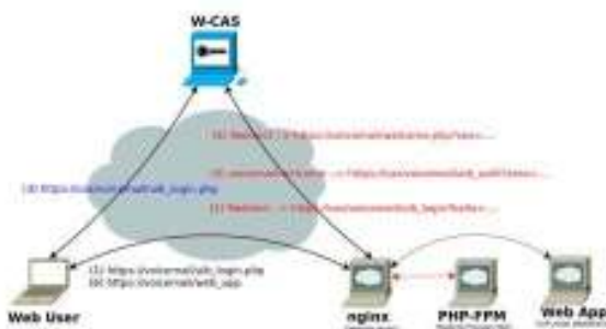
Fig. 7. VoiceMail: Authentication Mechanism

behaves of the user by sending either a HTML GET method or HTML POST method to the application's sign-on URL with all the needed credentials.