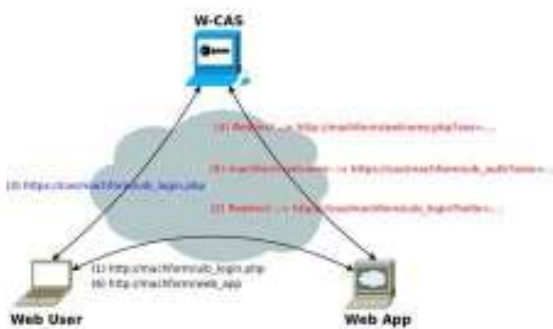
Fig. 5. MachForm: Authentication Mechanism

produced by login W-CAS:login and consumed by W-CAS:auth triggered by RESTful query from application server. The query is parameterized by the application name and W-CAS-Session . The key to decrypt W-CAS-Session is found in the configuration indexed by the supplied application name.