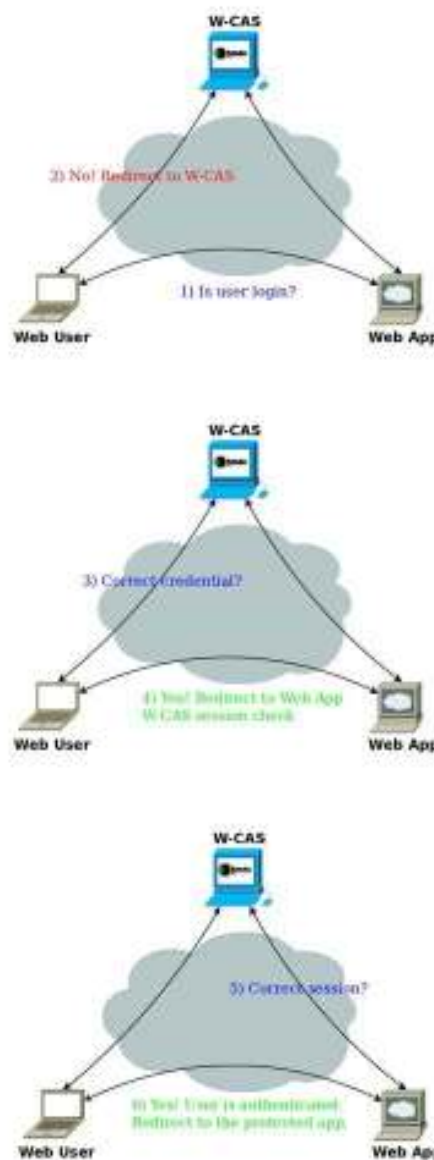
Fig. 3. W-CAS: Sign-on

One way to reduce the risk of credentials being stolen by phishing is to provide enterprise users with one and only one secure sign-on site for all enterprise Web-based application authentication procedures. The users will be informed and educated about the sign-on URL (Uniform Resource Locator),