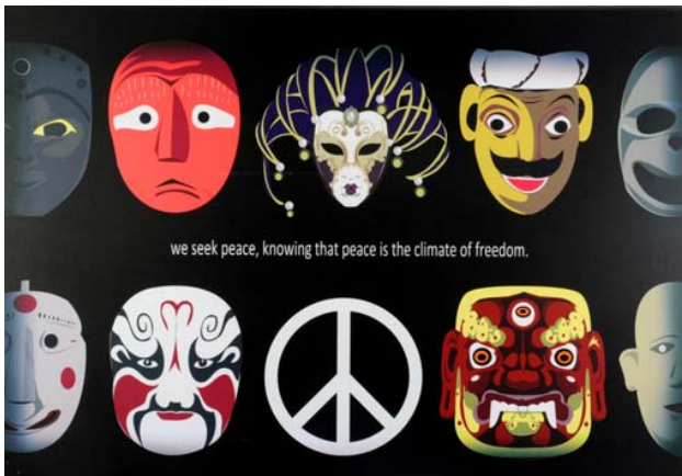
Fig. 1 "One Nation" poster design by a Malaysian student

An exhibition entitled "One Nation" was showcased to local and international viewers consisting of the general public, professionals, academics, artists and students. The exhibition challenges students to explore new creative avenues and refine their skills to the highest levels and serves as an inspiration to improve further. The exhibition is a selection of some 30 posters, on the theme or title of One Nation, created by Arts and Design students. The class which exhibited the posters was composed of students of various nationalities. There were Bangladeshis, Chinese, Indians, Indonesians, Iranians, Iraqis, Nigerians, Saudi Arabians, etceteras as well as Malaysians.