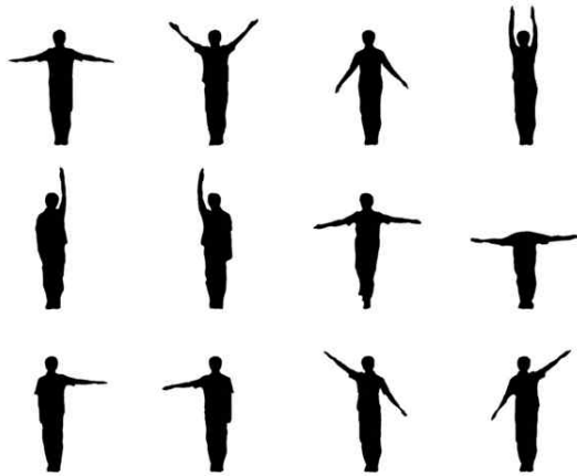
Fig. 2 Recognition Poses

To construct feature database, human pose images are captured by 5 cameras. These cameras are placed at around of human and used to take a photo when human takes a pose. It is converted from photo to silhouette image manually. Histogram-based feature is extracted and used as input of PCA. After reducing dimension of vector, neural network is trained. This is training task of recognition system, and input process is almost same. To use real-time camera input, system uses background subtraction, binarization and de-noising. After these processes silhouette images are used as input of pose recognition process.