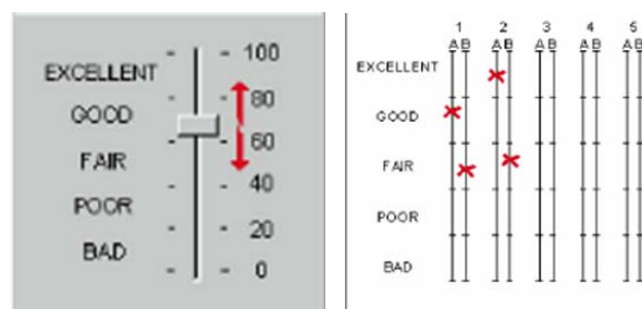
Fig. 1 Quality scale for DSCQS evaluation

The results are analyzed in as follows: Positions on the vertical scale are converted to normalized scores in the range 0 to 100. Each pair of scores is then converted to rating difference. The overall difference in quality is given as MOS (mean opinion score), which is computed as the mean value the differences from all observers related to one image pair. The higher the MOS, the more distortion in the image is visible.