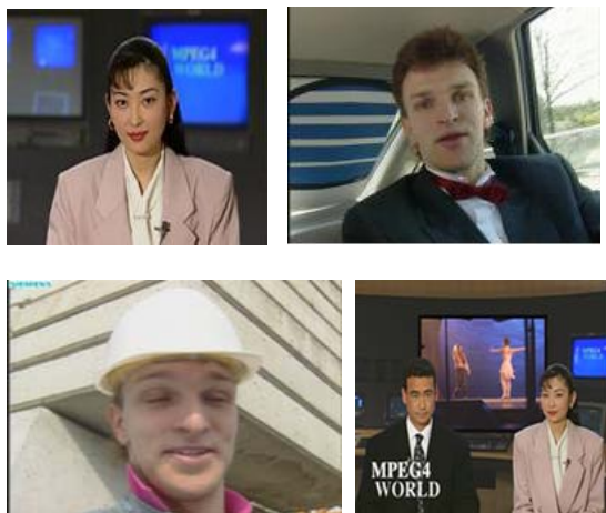
Fig. 2 originals sequences

Akiyo original sequence, Akiyo Coded / decoded with 24K bits/s, Akiyo Coded / decoded with 64K bits/s, Car phone original sequence, Carphone Coded / decoded with 28K bits/s, Carphone Coded / decoded with 64K bits/s, Carphone Coded / decoded with 128K bits/s,