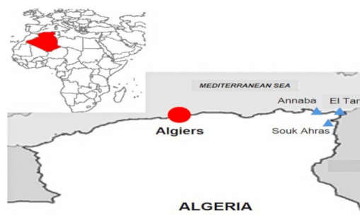
Fig. 1 Geographical locations of the study areas

The research survey was conducted for six months from January to June, 2014, in cities and villages of the three districts: Souk Ahras, Annaba, and El-Tarf located in north-eastern Algeria (Fig. 1). The Annaba region is a coastal town situated in the central part of north eastern Algeria 533 km from Algiers. The El-Tarf region bordering the city of Annaba is located 589 km from Algiers. The area of Souk Ahras is located in the far eastern part of Algeria, near the Tunisian border, and 554 km from Algiers.