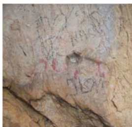
(b) Tifra site (Tigzirt sur mer)