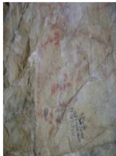
(a) Ifigha site

The nonexistence of keepers, facilitates the degradation and destruction of these sites. Thus, sites that have stood for thousands of years to the vagaries of nature can disappear in less than a decade.