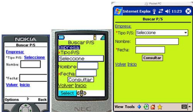
Fig. 2. Three screenshots for the same RDL

organization, etc.—, the client device can also receive semantic information about the data that the rendering contains. Therefore, the mobile application targets not only the user who reads those data, but the actual device is capable of recognizing information contained in the application renderings. Consequently, it can be party to the navigation of user the handling the device and undertake actions with the information that the user receives, either by accessing other services in applications within the actual device or as befits the nature of this information.