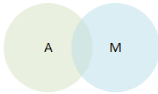
Fig. 3 Evaluation Metrics Strategy