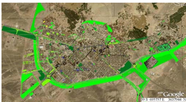
Fig. 3 Greenspace of Naein City in 2036 according to comprehensive plan of the city