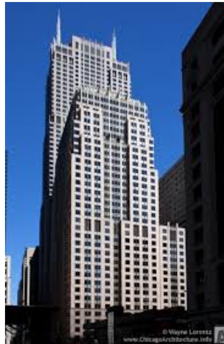
Fig. 5 AT&T Corporate Center [24]