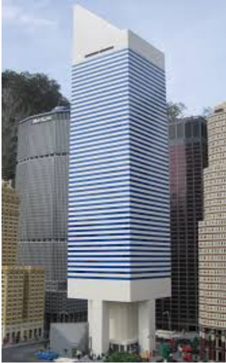
Fig. 9 Citicorp T. [22]