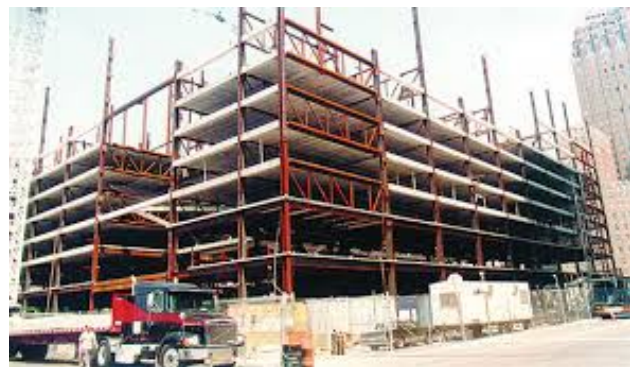
Fig. 3 Staggered truss system

In this system story-high trusses span in the transverse direction between the columns at the exterior of the building. The floor system acts as a diaphragm transferring lateral loads in the short direction to the trusses (Fig. 3) [22].