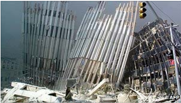
Fig. 1 A U.S. Navy assault ship built with steel from the fallen World Trade Centre

LEED program. Further, most green codes and standards recognize the excellent potential of CFS at reducing the amount of construction waste generated at a site. Most of this is due to the almost universal use of pre-engineered and assembled panels to build steel assemblies using modern, efficient technology. For example, of all the waste from a 2000 sq. ft. residence framed with steel, less than 2 % of steel is left over and can be recycled compared to that same house built of wood generating 20% of waste that will be sent to landfill [8].