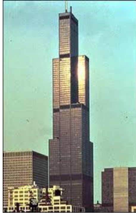
Fig. 7 Sears Tower [21]