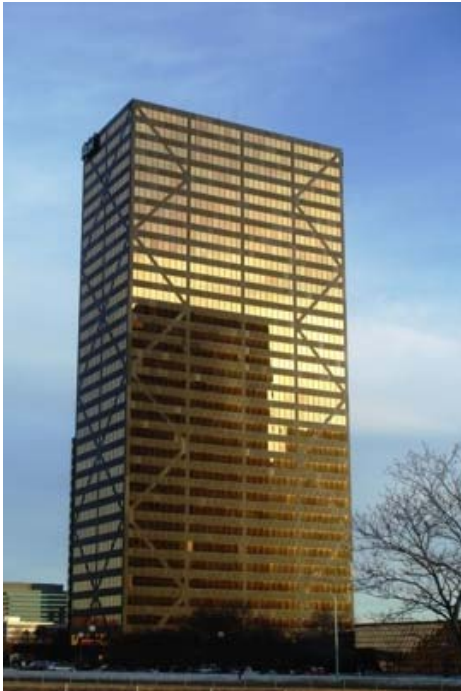
Fig. 6 Guardian B. [20]

Hybrid system gaining popularity is the concrete-filled steel tube column, where the erect ability of a steel frame is maintained, but the cost effective axial load capacity of high strength concrete used. The steel tube provides confinement to the concrete much more efficiently than normal reinforcement does, and it is on the extreme outside, where it is most effective (Figs. 9, 10) [23].