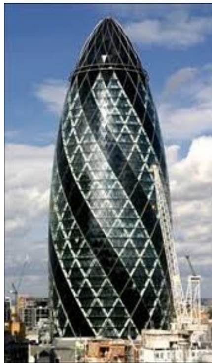
Fig. 8 Swiss re B. [22]