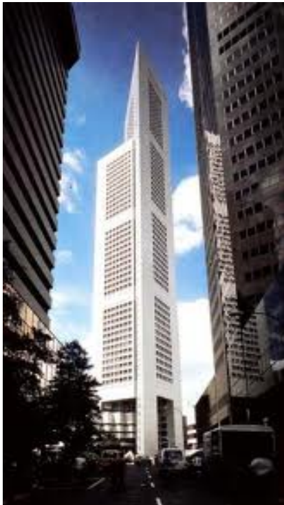
Fig. 10 Overseas Union T. [22]