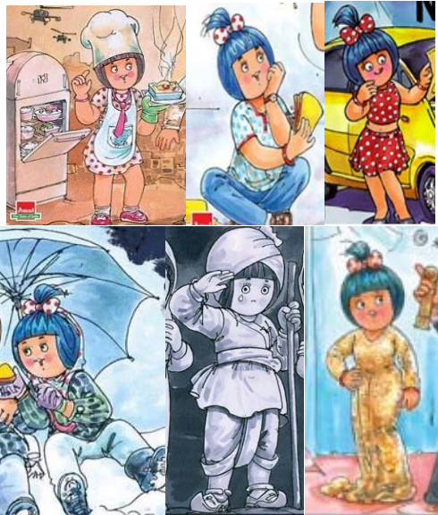
Fig. 9 Mascot dressing according to the topic

From the reactions to the different messages communicated through Amul girl, it is notable that the mascot is simple in terms of design and fashion trends. The use of the mascot relates easily with the consumers resulting in brand recognition among their customers.