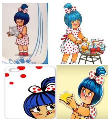
Fig. 7 Connecting the mascot and the brand product