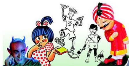
Fig. 1 Different mascots of companies

The use of mascots needs to be in such a manner that they are in sync with other advertising and branding elements such as logos, slogans and jingles. In most cases, they tend to take the form of names, or the benefit accrued from the use of the product. For example, Fig. 2 shows the Mr. Clean mascot, which communicates that the product is related to cleaning and hygiene, and secondly, it shows relationship of mascot and product.