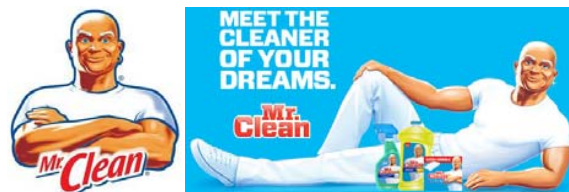
Fig. 2 Mr. Clean (official brand mascot) communicates the products are about cleaning and hygiene