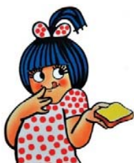
Fig. 3 Amul girl (mascot)

to comment on social issues and trending affairs, sometimes which include social and political messages, as seen in Fig. 4.