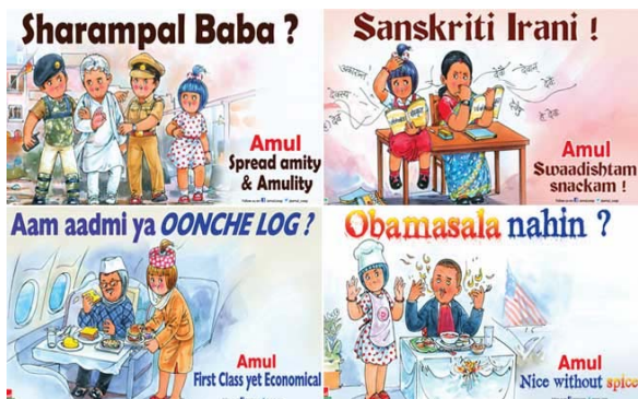
Fig. 4 Amul girl (mascot) comments on social and political issues in a humorous manner

The Amul Girl mascot has managed to communicate about the product in a humorous manner which allows the audience to associate with it. The use of humour based on the reality of life has given the company a platform to differentiate itself from other advertisements. Also, since its inception, the use of the mascot has attributed to the creation of brand positioning among consumers.