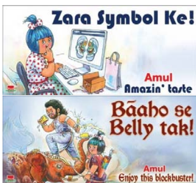
Fig. 5 Amul girl (mascot) communicates about the product in a humorous manner

The Amul Girl mascot has managed to communicate about the product in a humorous manner which allows the audience to associate with it. The use of humour based on the reality of life has given the company a platform to differentiate itself from other advertisements. Also, since its inception, the use of the mascot has attributed to the creation of brand positioning among consumers.