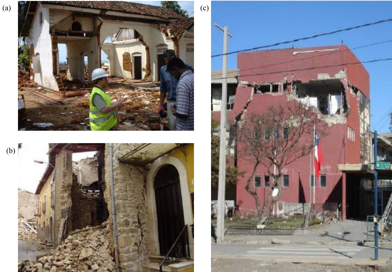
Fig. 10 Examples of damaged and collapsed building structures documented in reports by EEFIT (a) Tsunami damage to a residential building in Kalutara, Sri Lanka [32] (b) Earthquake damage to a traditional residential building in San Gregorio, Italy [41]. (c) Earthquake damage to a school building in Talcahuano, Chile [35]

demonstrate how to inspect and evaluate building structures for safety [29].