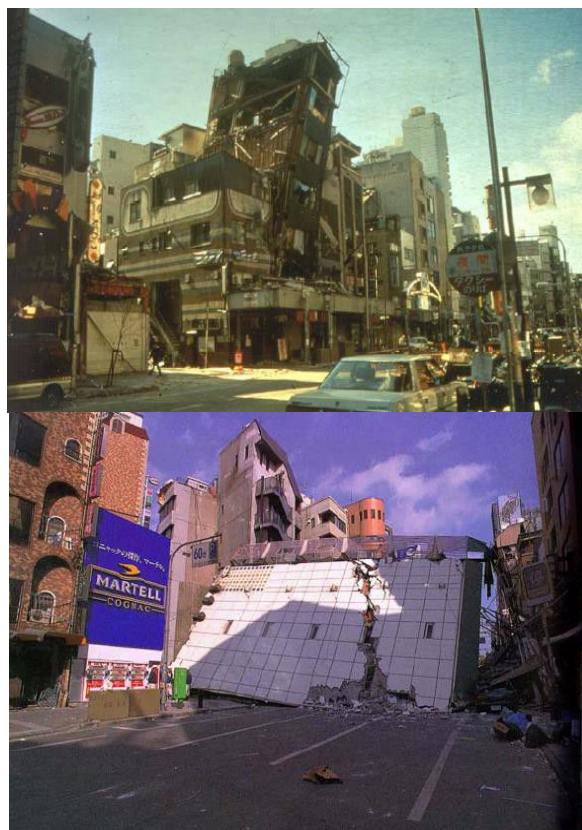
Fig. 3 Example of damage witnessed after the 1995 Kobe, Japan earthquake (a) An unstable building structure [1]. (b) An unstable building structure which collapsed less than 24 hours after the original earthquake [1]

may have collapsed and others may have become unstable which could collapse at anytime, see Fig. 3.