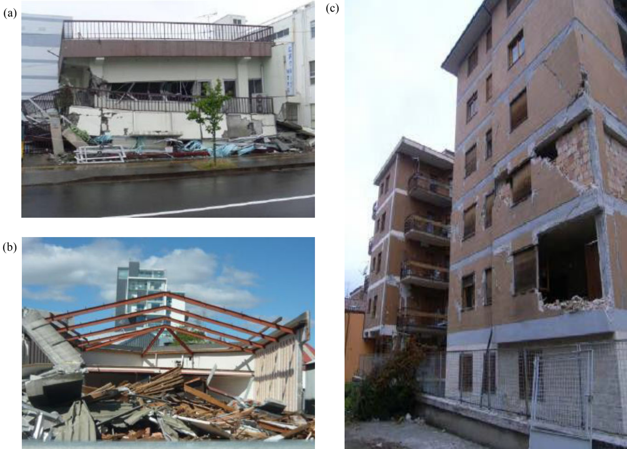
Fig. 11 Examples of damaged and collapsed building structures documented in reports by EEFIT and other publications (a) A collapsed office building in Oroshi, Japan [36]. (b) A partially-collapsed warehouse in Christchurch, New Zealand [39]. (c) Earthquake damage to an apartment block in L'Aquila, Italy [41]

structural and non-structural defects. The use of diagrams and photographs to display the different types and varying degrees of damage which can be caused to building structures will help search and rescue personnel to make more accurate and consistent judgements when assessing damaged building structures in regards to structural stability.