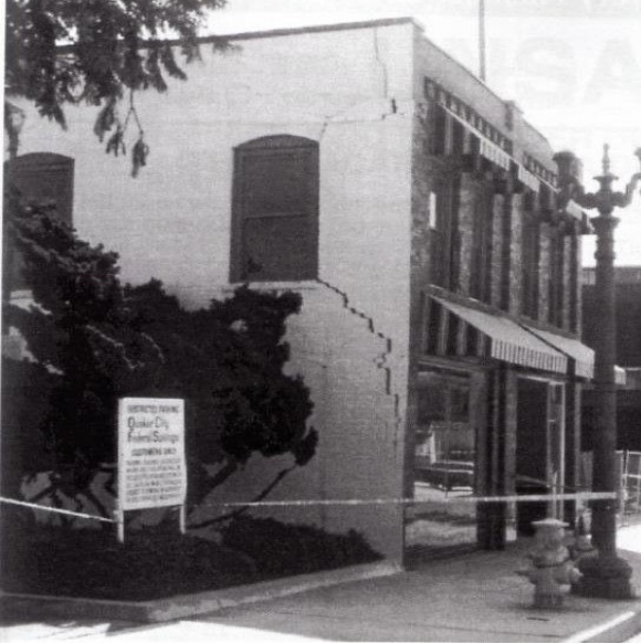
Fig. 6 Example of a crack pattern in the side wall of a masonry building documented in the ATC-20 series [29]