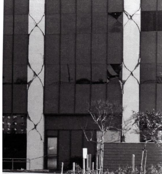
Fig. 9 Example of failed concrete piers (x-cracks) of a multi-storey building documented in the ATC-20 series [29]