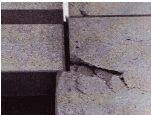
Fig. 8 Example of cracking of a precast concrete support of a parking structure documented in the ATC-20 series [29]

The ATC-20 series has used photographs throughout to great effect in order to demonstrate the different types and varying degrees of damage which can be caused by earthquakes. The reason for this is not to learn lessons for future design or construction but to assist those undertaking the tasks of assessing and classifying damage to building structures to make accurate judgements and to promote consistency.