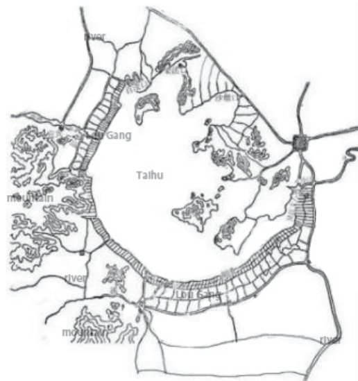
Fig. 3 Distribution of polder system in Lou Gang, Taihu Lake

thousand years of development, the Lou Gang polder system of Taihu Lake formed a mature water composed of the Taihu Lake dyke, the canal Hetang, the lake Lou Gang, several Hengtang and Wanqing polder fields in the Northern Song Dynasty Benefit system. The abundant water in Taihu Lake area flows to the land through Lou Gang and irrigates the Hangjiahu Plain area. Nowadays, most of the Lou Gang has disappeared due to lack of protection. Only the system of Lou Gang polder in Huzhou area has survived to this day, and it still has a fresh vitality. Lou Gang body of Taihu Lake is a combination of water conservancy, economy, ecology and culture. It has comprehensive functions of drainage, irrigation and navigation, and plays an important role in the world water conservancy system.