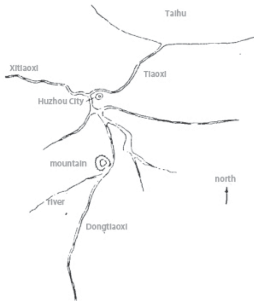
Fig. 1 Site selection of ancient Zicheng

has begun to have a water town in the south of the Yangtze River (Fig. 2).