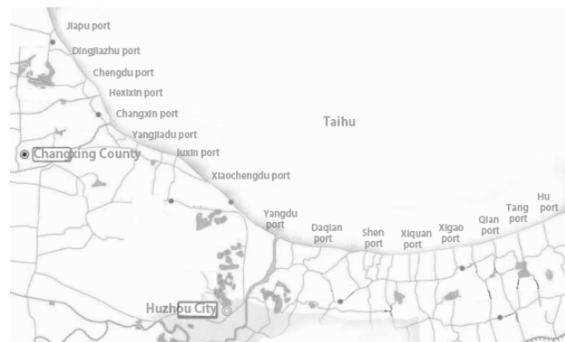
Fig. 5 The relationship between Lou Gang system of Taihu Lake and Huzhou City