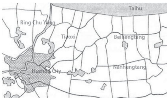
Fig. 2 Basic urban form layout of Huzhou