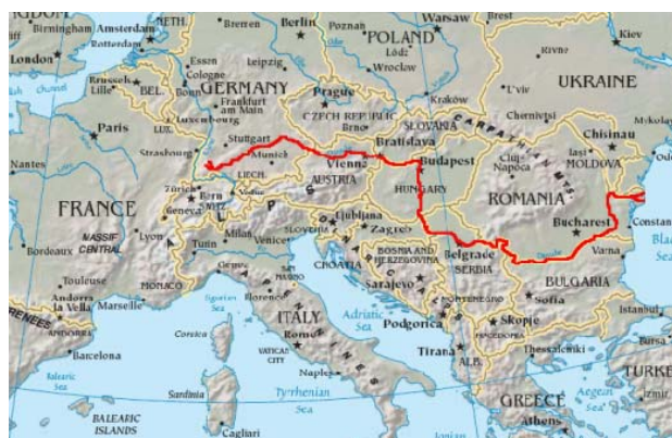
Fig. 1 Map of Danube River

originates in the Black Forest in Germany as the much smaller Brigach and Breg rivers which join at the German town of Donaueschingen. After that point it is known as the Danube River and it flows southeastward for a distance of some 2850 km, passing through four Central and Eastern European capitals, before emptying into the Black Sea via the Danube Delta in Romania and Ukraine. This river flows through or acts as part of the borders of ten countries: Germany (7.5%), Austria (10.3%), Slovakia (5.8%), Hungary (11.7%), Croatia (4.5%), Serbia (10.3%), Bulgaria (5.2%), Moldova (1.6%), Ukraine (3.8%) and Romania (28.9%) (The percentages reflect the proportion of the total Danube basin area), shown on the Figure 1. Major cities along the Danube include the three national capitals of Vienna (Austria), Budapest (Hungary) and Belgrade (Serbia). Along its course (Figure 1), the Danube is a source of drinking water for about ten million people. But most states find it difficult to clean the water because of extensive pollution.