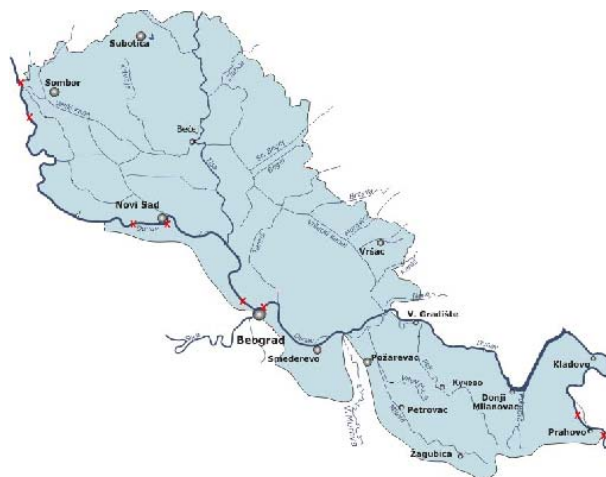
Fig. 2 Sampling locations from Danube River in Serbia

We took water samples from eight different locations along the course of Danube River (Figure 2), during December 2010. All samples were prepared according to ASTM Standard Test Method [4]. Each water sample was filtered through a slow depth filter and then distilled. After the distillation, the samples were mixed with the scintillation cocktail Optiphase HiSafe 3.