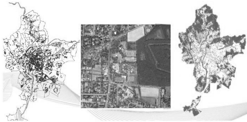
Fig. 1 Lyon, Charte de l'Arbre

Another meaningful example in such a direction is given by water conservation (adaptation intervention), which also translates into energy savings (mitigation intervention). Understanding possible synergies between adaptation and mitigation measures can soften conflicts and, in such circumstances, good planning can become very useful. For example, if it is true that a higher living density is a means to improve the overall energy efficiency of an urban area, it is also true that responding to climate change with adaption requires space in and around buildings. In this case, good urban planning can lead to a reduction in greenhouse gases and contribute to adaptation, offering the parallel opportunities of lowering carbon dioxide emissions and the recourse to an average density of settlements, their differentiated use and green areas.