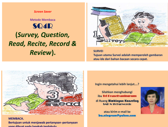
Fig. 3. Some displays of Screensaver "Learning Guidance"