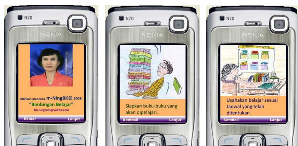
Fig. 2 Content services on the application of m-NingBK ©: "Learning Guidance"

ICT applications content that have been developed as shown by Table I.