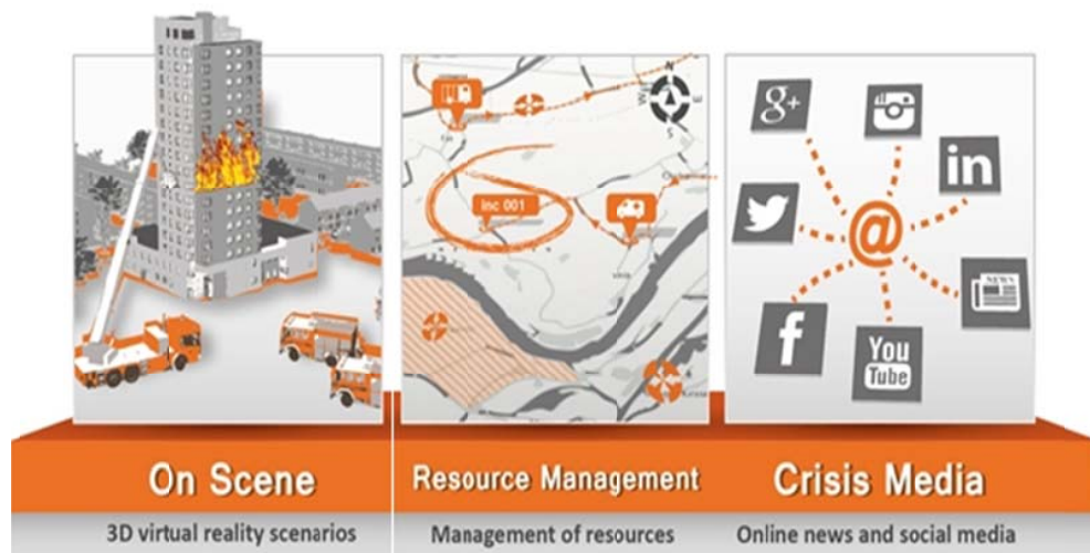
Fig. 2 XVR Platform

The application Virtual Reality training software for safety and security (XVR) consists of several programs. They are: XVR Crisis Media, XVR Resource Management, XVR On Scene and XVR Toolkit (Fig. 1). These programs serve to the resolvers of emergency or crisis situations in preparation and practicing practical abilities [16].