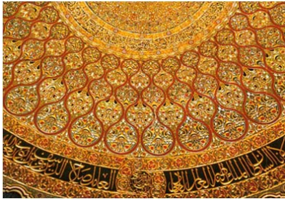
Fig. 5 Ornamenting the dome with calligraphic designs in the Dome of the Rock [11]

and objects. It has been used by non-Arabic speaking people such as Persians, Turks and Indians.