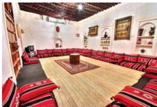
Fig. 8 The nature of the Arab people homes decorated with Turkish rug and imported cushion covers

Bedouin products were appreciated by local people who used them in decorating their houses and they are purchased by the tourists and countries around as a remembrance of their visit and decorative objects as well. However, with the evolution of home furnishing, local people became uninterested in and un-attracted to the Bedouin products as a result of the availability of imported soft fabrics in contemporary colours in the market at the time that Bedouin products remained stable on those respects.