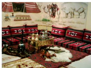
Fig. 9 Using the imported cushion covers and rug that imitate Bedouin products because of the absence of the traditional in the local marketplace; Photographed in 2007