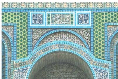
Fig. 2 The use of continuous geometric designs interlaced with overlapped floral and calligraphic designs in the Dome of the Rock [11]

Geometric motifs were used extensively in the Islamic world to decorate religious buildings as well as for designing decorative surfaces such as tiles, wood, book covers, papers, glasses, carpets, textiles, plasters, walls, ceilings, floors, doors, windows, pots and lamps. As Islam spread to new areas, artists combined their penchant for geometry with the existing traditional designs in these new areas which helped to create distinctive Islamic motifs [14]. This art symbolizes the natural Islamic vision of the universe and some of the greatest examples of these geometric patterns can be seen in examples of Islamic architecture such as the Dome of the Rock and Alhambra Palaces. A wide range of basic Islamic motifs, drawn from geometry, calligraphy and floral influences make up an endless variety of forms (Figs. 2 and 3). Artists used different bright colours with these geometric patterns such as deep blue or turquoise, red, black, and white with gleaming gold and glitter effect. Though beautiful and harmonious, these include hues not found in nature [5], [14].