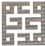
Fig. 6 Square and rectangular kufic script [1]

Calligraphy inscriptions are usually combined and set against a background of geometric and floral patterns which surround the letters. Also, they provide additional symbolic meaning.