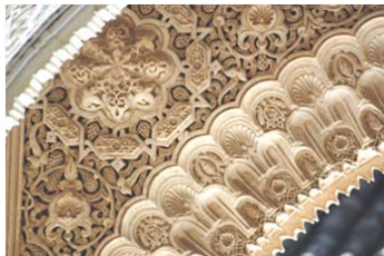
Fig. 7 The use of arabesque patterns in Alhambra Palaces [4]

Floral patterns can be seen in arabesque designs which are formed by an abstraction of the earlier leaf-scroll motifs [1]. This vegetal ornament is characterized by a continuous abstract stem which splits repeatedly to produce a series of curving counterpoised vegetal patterns flowing in all directions. The sense of periodicity and the rhythm is very noticeable in these patterns (Fig. 7).