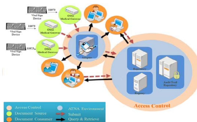
Fig. 2 The whole picture of the study