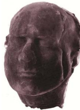
Fig. 6 Marc Quinn, 1991 'Self' (sculpture) New York

For several years he had been collecting and keeping his blood in the fridge, then filled in the form of his head, created a self-portrait. For creating this figure he used blood approximately by volume equals to the blood of a man of average years. This is stored in the New York Museum of Modern art. Thus, taking medical analysis of human DNA contents, which is the achievement of genetic engineering artists began to create their works of art. Also the huge interest is arisen to the biological nature of man to his particular ancestor history and personal characteristic features. In general, a modern work of art has squeezed its artistic scope and start brining information from different areas of anthropological sciences. In such situations a character perceiving and creating as an object becomes the subject and is grouped, and is perceived as a literary text around a man.