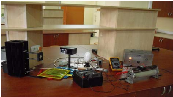
Fig. 2 Real experimentation materials regard photoelectric effect

The physic achievement test was applied again to the experimental and control groups as a post-test. The SPSS 11.00 (Statistical Package for Social Sciences) statistical program was used to evaluate all the data collected from pre-and post-tests. The independent samples t-test, one way anova and tukey hsd test were used for testing the data obtained from the study at 05 level of significance.