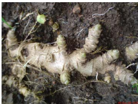
Fig 2. Rhizome of binahong

Classification of plants binahong as follows: 1) Kingdom: Plantae (plants), 2) Subkingdom: Tracheobionta (vascular), 3) Superdivisio: Spermatophyta (produce seed), 4) Divisio: Magnoliophyta (Flowering), 5) Class: Magnoliopsida (dashed two / dicots), 6) Sub-class: Hamamelidae, 7) Order: Caryophyllales, 8) Familia: Basellaceae, 9) Genus: Anredera, 10) Species: cordifolia Anredera (Ten.) Steenis [5]. The results of phytochemical binahong with test tubes in getting the chemical content is flavonoids, saponins and alkaloid[14]. Binahong plants have a total flavonoid content of 0.6 mg per 100 grams of dried root powder[6].