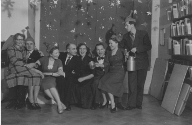
Fig. 5 The personnel of Building Standards Committee was still limited in 1950's. Christmas' Party

were to be built both sturdy and particularly warm, which further increased building costs. Research done in the field of building, as well as the standardisation work utilising the results of the research, would have a significant role in keeping those costs under control [14]. Koiso-Kanttila's related speeches and article drafts from the 1950s show his true passion for the work at hand.