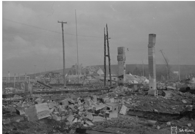
Fig. 2 The destruction of WWII was heavy particularly in Northern Finland. As a result of the war some 40–47% of the dwellings in the area were destroyed, and the provincial capital of Rovaniemi was burned to the ground