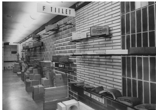
Fig. 6 Erkki Koiso-Kanttila renewed the Permanent Building Products Exhibition using SfB classification system

Koiso-Kanttila renewed the exhibition space, as well as the exhibition itself, quite thoroughly. By means of skilled exhibition design he was able to fit plenty of exhibition material into the space without creating a feeling of overcrowdedness. For example, the wall surfaces doubled as a paint exhibition, the floors as a floor covering exhibition and the balcony railing as a sheet glass exhibition. Material exhibitions additionally had information for instance about the costs, heat insulation and breathability of the materials, as well as other important information to be taken into consideration when choosing building materials [18].