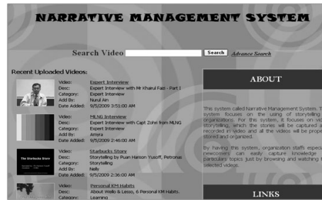
Fig. 3 NMS Main Page

Fig. 3 shows screenshot of the main page play video page.