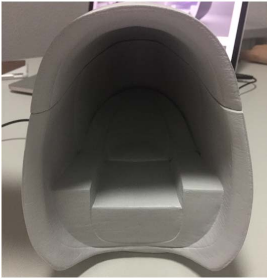
Fig. 5 3D print Design Concept A (front-view)

made and sent out to the users who made those comments.