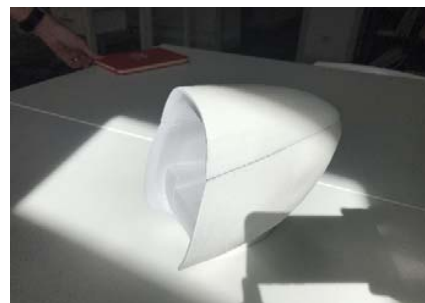
Fig. 4 3D print Design Concept A (side-view)

Subjects underlined the featured ambience light and temperature control as “very useful” but rejected the idea of being monitored by a thermal camera. The ability to rotate the seat in itself was also decisive for the Design Concept A, since 43.1% of the users stated that they usually rotate their current office seats daily, many of them making it as an habit while thinking (unconscious of that rotation). However, some free comments had some common points between subjects and came up with some interesting design facts. Design Concept A was compared to the first-generation of iMacs for its roundish design or even to an egg-shell.