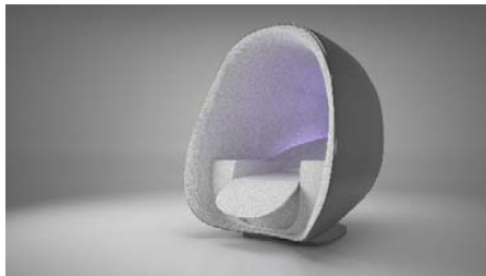
Fig. 1 Design Concept A

Of course, that given that the visual effect play an important role on the acceptance of usage of such a seat – given the insights stated in the precedent section – the team firstly decided to come up with a couple of design concepts and to A/B test them.