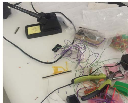
Fig. 7 Soldering the sensors was a challenge in itself

At last, a temperature and humidity sensor was added so the system could check the outside air temperature and set some vents on to try to simulate a cooler ambience (all testing was done indoors in a 22°C room). These sensors were connected to particle photons who offer a cloud service to register the data. This was also ideal because everything worked wirelessly without the need to run wires, allowing testing and repositioning of the sensors to be much easier.