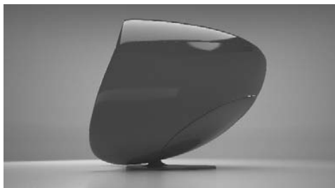
Fig. 2 Design Concept A (side-view)

The two designs were a bit similar but in fact contained some relevant functionality aspects that were worth exploring and presented to the users. The Design Concept A had a very soft interior with reclinable chair, retractable table, sound-proof interior, temperature control through vents and pumps, LED colour lighting ambience and 3D sound. The structure allowed to easily be rotated by the user and the seat would be embedded with pressure sensor matrix using Velostat material