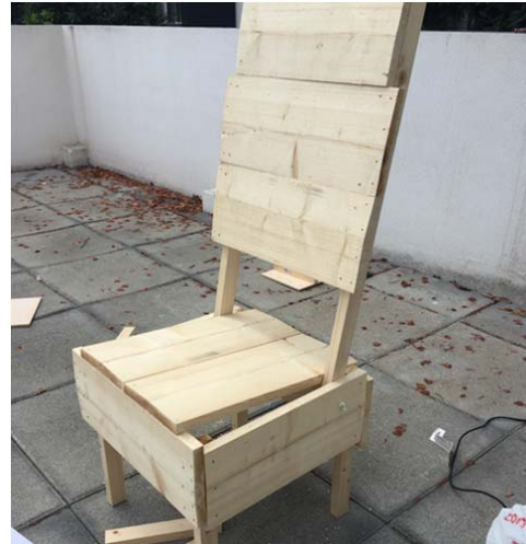
Fig. 6 The prototype chair just after construction

First, we used pressure-sensitive conductive sheets (Velostat) sewn onto the woven conductive fabric with a thin conductive thread to build two squares (matrix) for the seat and its back. These would allow to check the user's posture and presence. Afterwards, we added an electret microphone amplifier and an Adafruit's air quality sensor. Both would be used to check if external factors such as noise and oxygen levels pollution would interfere with the productivity of a user.