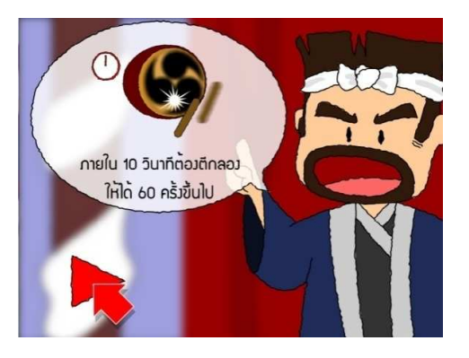
Fig. 5 Vocabulary test

A. Mass Media Quality of the Interactive Online Multimedia Instruction on Basic Japanese Vocabulary