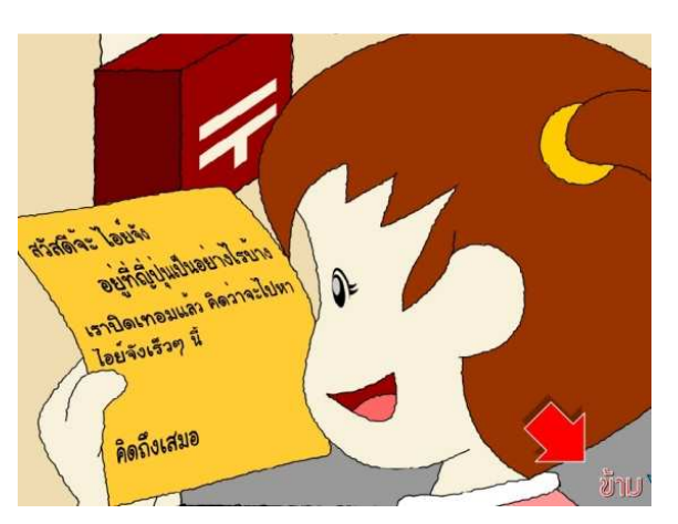
Fig. 1 Introduction page

Besides the interactive online multimedia instruction on basic Japanese vocabulary, there were tools to evaluate the quality in terms of contents and mass media production: the quality assessment form for the interactive online multimedia instruction on basic Japanese vocabulary and the satisfaction evaluation form for the sampling group.