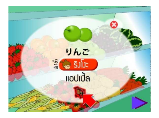
Fig. 4 Learning vocabulary from fruits in the basket