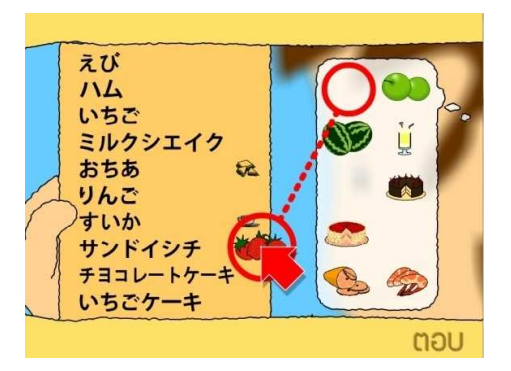
Fig. 3 Interactive element in the lesson