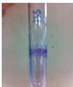
Fig. 2 Z. mobilis TISTR 551 Biofilm Formations on The Polystyrene Surface After 4 Days Cultivation. The Bacterial Attachment was Stained with Crystal Violet

As in this work, Z. mobilis biofilm was hypothesized to be more tolerate to the inhibitory compounds that available in the rice bran hydrolysate than the planktonic cell or free cell, therefore, the fermentation efficiency under these two mode of growth were compared in same fermentation condition. The ethanol yields were found to be 0.066 \pm 0.079 g/L in the