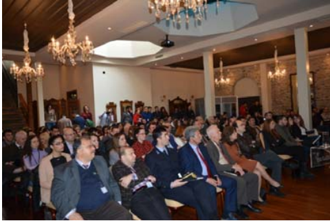
Fig. 5 Participants of the International Conference "Frontiers in Environmental and Water Management" that took place on 19-21 March 2015, in Kavala, Greece