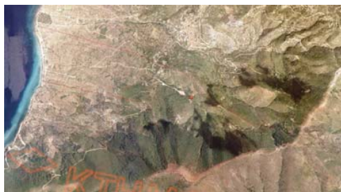
Fig. 2 The red lines indicate the boundaries of the Kallirahi torrent watershed that was the selected study watershed and the red circle is the location where the system was placed

The island has 18 major torrents. Torrents have typically ephemeral or intermittent flow [1]. Compared to streams they have more irregular stream flow (periods of no flow to periods of flash floods), steeper channel slope and higher sediment transport capacity. The torrent selected for this study was Kallirahis (Fig. 2), that experienced a severe wildfire in August 2013. Watersheds after wildfires tend to have high surface soil erosion.