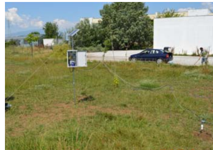
Fig. 4 The field setup of the Automated Soil Erosion Monitoring System (ASEMS)

Erosion Monitoring System (ASEMS); a common surface erosion technique [6]. During the study period the system measurements will be compared with the measurements provided by the erosion pins.