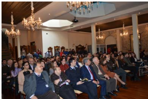
Fig. 5 Participants of the International Conference "Frontiers in Environmental and Water Management" that took place on 19-21 March 2015, in Kavala, Greece