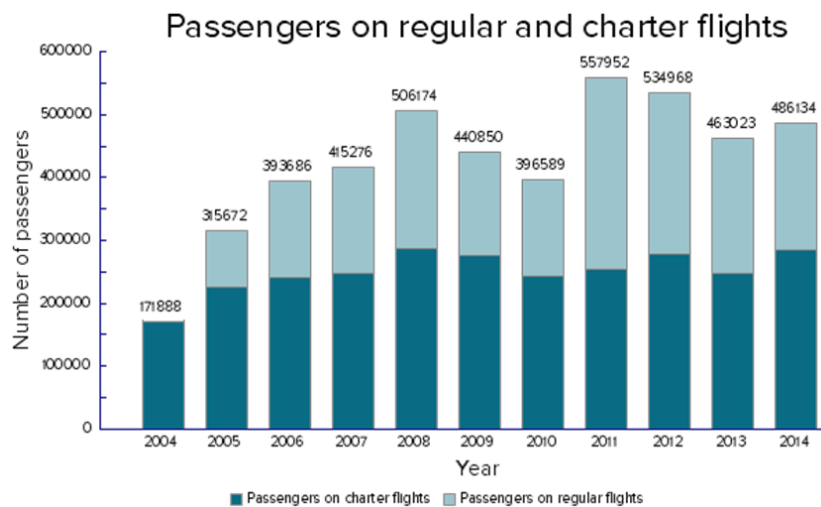
Fig. 1 Passengers on regular and charter flights [6]