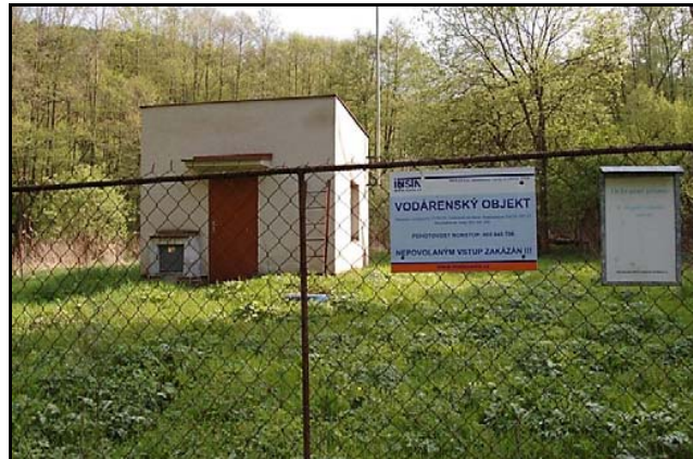
Fig. 3 Ježkovice RV12 drilled well and its surroundings

Note: Red circle shows the site of drilled well