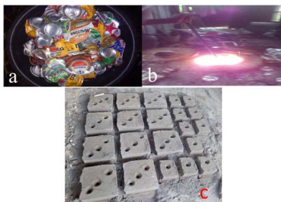
Fig. 1 Materials and casting of HEA (a) Drink cans, (b) stirring of the alloy mix and green sand mold prior to pouring of the melt

(KWASU), Malet, Nigeria. Each sample was analysed at room temperature of 18 °C and 50% relative humidity by loading gradually at a strain rate of 1.25 \times 10^{-4} \text{ s}^{-1} until sample fractured. Average values and standard deviation of the tensile properties were estimated. The standard deviation was inserted in the graph as the error bars. Elemental analysis known as spark test was carried out on rectangular samples of all alloy grade using ARL Optical Emission Spectrometer, model QuantoDesk AA83673 at Metallurgical and Materials Laboratory, University of Lagos, Nigeria. Before the spectrometric analysis, samples' surfaces were ground and polished using emery paper of different sizes (from coarse to fine) and polished cloth. Structural analysis was carried out with the aid of Philip X-ray diffractometer. Peaks were fitted using X'pert high score software and fractured sample surfaces were tracked morphologically with the use of ASPEX 3020 Scanning Electron Microscope at Microstructural Laboratory, KWASU.