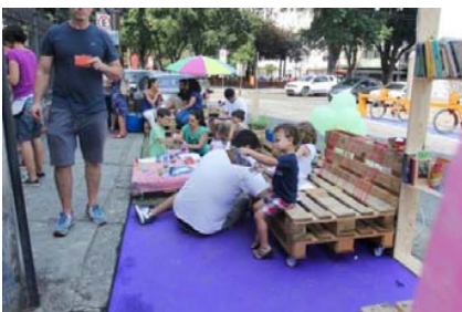
Fig. 12 Park(ing) Day, Rio de Janeiro, Brazil [22]

These sidewalk extensions promote the use of the public space in a democratic way and allow the community to build its own social space, even though temporarily. Some interventions can remain for hours, days, months or years, depending on the action. This is a movement which was initiated in San Francisco, USA, called Park(ing) Day, and aims to denunciate the big offer of space which are designed for cars and to boost city appropriation and social participation. It is important to highlight that, in the past few decades, some Brazilian cities such as São Paulo and Rio de