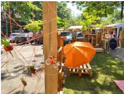
Fig. 11 Temporary parklet, Rio de Janeiro, Brazil [22]

Among the temporary initiatives which aim to encourage Active Transportation and claim for opportunity balance for pedestrians and motorized vehicles, there are assemblies called parklets. The replacement of street parking spaces for the installation of parklets subvert their original use and work as social gathering places and as invitations for people to use the road space which was designed originally for cars. According to the National Association of City Transportation Officials, parking spaces have the potential to host a big range of uses beyond what was originally designed to them and to boost urban vitality [9].