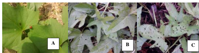
Fig. 1 Leaves area were infested <25%(A); leaves area were infested between 26 - 50%(B); leaves area were infested between 51 - 75% (C)

4 = leaves area were infested between 76 and 100%