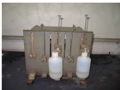
Fig. 2 Extraction with MIBK

This extraction step is carried out to upgrade niobium oxide by using the extractant, MIBK. After filtration, the filtrate solution was prepared at 2N HF and 8N H_2SO_4 . To obtain one liter solution, the filtrate solution was made to the concentration of 2N HF and 8N H_2SO_4 solution and also distilled water was added. From one liter solution, 100ml of aqueous solution and 200ml of the organic solvent (methyl isobutyl ketone) were put into the polyethylene separating funnel. The funnel was stoppered well and was shaken on the shaker. After shaking for 30 minutes and allowing settling, rich organic solvent and raffinate were separated. Niobium and tantalum were in the organic phase and the impurities were in the raffinate. To remove the impurities, the organic 200ml was scrubbed with 2N H_2SO_4 by the shaker. The niobium rich was extracted into the aqueous solution and remained tantalum containing in the organic phase. The niobium containing solution was mixed with 8N H_2SO_4 for solvent extraction. After that niobium was extracted into the pregnant solution and was separated as in tantalum in organic. Outgoing aqueous with rich niobium pregnant solution was obtained and collected for the precipitation step. This process is shown in Fig. 2 [3-7].