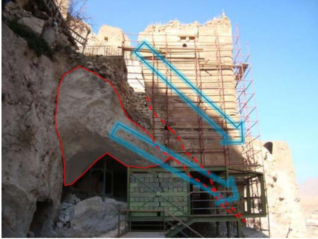
Fig. 1 Middle Gate general view, cracked rock & force paths, and crack pattern