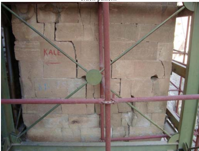
Fig. 2 Close view of the middle gate entrance wall on the valley side