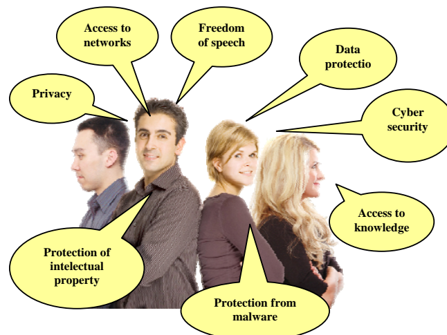
Fig. 1 Digital rights in knowledge society

Researches have shown that access is a precondition, although capacity and motivation are the biggest barriers in use of Internet. Certain demographic groups have different reasons for their weak Internet access.