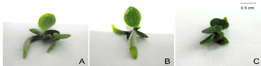
Fig. 1 Growth of Phalaenopsis ‘Silky Moon’ protocorm-like bodies on treated 25ml solid Hyponex medium cultured for 14 weeks A = 150µL of 5.25% sodium hypochlorite; B = 30µL of 2.5% iodine + 2.5% potassium iodide: 2% merbromin solution (1:3); C = control (autoclaved medium)