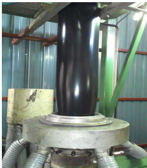
Fig. 2 Polybag being blown out from blowing machine die.

As in agriculture, almost all of the used polymeric materials are discarded and often left unattended into soil or being disposed in the landfill. This is due to the high cost of removal and less potential of recycle due to the high percentage of foreign contamination. Thus, the interest of developing degradable polymer is becoming more important and crucial as to counter measure the problem of pollution and soil sterility caused by the polymer wastes. Photodegradable polyethylene has been developed and the processing parameters have been studied in order to produce the desired product for application in the agriculture, product packaging or even medicinal.