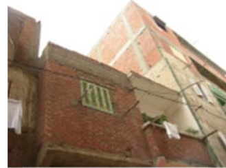
Fig. 4 Heights