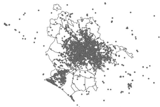
Fig. 1 Mapping Rome city divided in UZ. Black dots are geolocations of cafes and restaurants

Another important phase of data processing is devoted to filtration of data. It mainly consists of elimination of repetitions “nan” values, and incomplete data. Furthermore, datasets having a spatial resolution greater than UZ are selected, like social housing and gross incomes. In fact, information for these two refers to municipal area that includes several UZ. In these cases records for each UZ are replicated for all UZs belonging to the same municipal area. After data processing each dataset is saved as .csv file ready to be analyzed.