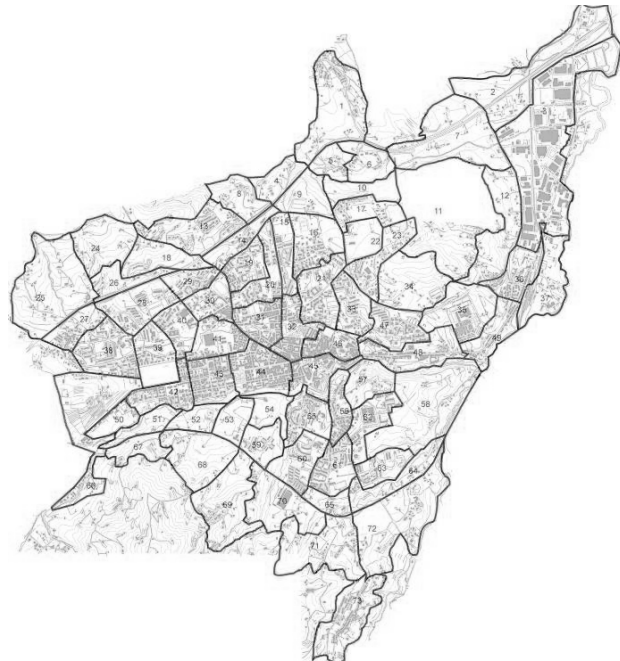
Fig. 1 Subdivision of urban places into attitudinal areas

The territorial division (phase 1) carried out a mapping scale 1/2000 and on the basis of arguments put forward by reading the information on the same map, as well as on that of the urban zoning, produced (n) 73 attitudinal areas. The graphical representation is in Fig. 1.