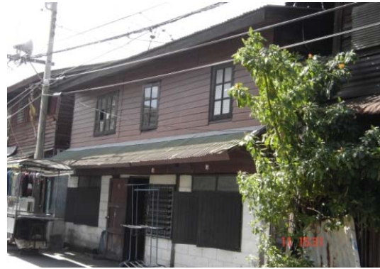
Fig. 1 Wood and mortar house (no fence)

The fence shows the better class of living and economy because they have more space and garage. The occupations of the members of these communities are various, such as laborer, company employee, government official, etc. But mostly they work outside the community, so the occupations that are left working inside the community are self-employed, low cost investment such as motorcycle-taxi, grocery stores, baby sitters, beauty salon. Their food is ordinary as most Thai people have. As a result of working outside the community, the traditional Thai culture left in the community is only on Songkran day and New Year day [2], which still have the traditional of inviting monks to perform the ceremonies and to bless for prosperity and luck of their families. [3]