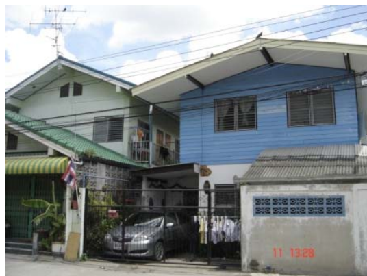
Fig. 2 Wood and mortar house (with fence)