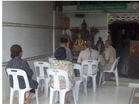
Fig. 6 Community of Committee Participation Meeting

Most people in the community are Buddhist and there is local temple called "Wat Duangjai 72 Pansa" that lacks a monk to perform religious functions and, as a result, if the members of the community want a small religious function, they need to invite a monk to perform activities. However, if it is a large religious function or particularly important day in the Buddhist calendar, they will make a trip to the nearby temple. [4]