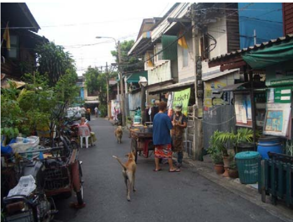
Fig. 5 Road in Community temple Ranonkhang 72