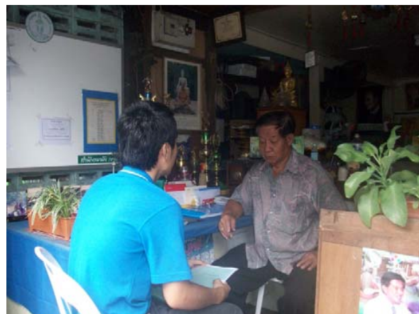
Fig. 7 Community Leader Interview

In regard to the working parents, they do not have time to teach their children the social etiquette or to give them a well-defined schedule that includes coming home at a certain time. As a result, children spend most of their time outside the house, socializing with friends (school, internet cafe, department store etc.) [5]. In conclusion, the combinations of these realities are eroding traditional Thai culture and they may be completely gone within one generation.