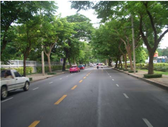
Fig. 4 Rama 5 Road near Community

home with three generations under one roof, with the grandparents taking care of the children while the parents go to work to earn money in order to support the household. The economic realities of this lifestyle force the primary earners of the household to leave early and come back late in the night. This restricts the time parents can spend with their family by relegating bonding to national holidays. The majority of people in the community have to work, and as a result, if you go to this community during the day, you will only find the elderly and the children that they look after.