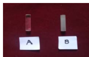
Fig. 1 Samples SBN1 (A: Before Annealing, B: After Annealing)

One thought thereafter, to determine the zone of immiscibility in a ternary system sodium borosilicate, i.e. the areas from which certain compositions can present a separation of phase.