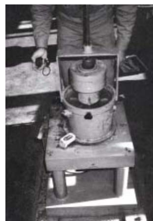
Fig 2 VC Meter

RCC layers thicknesses can be up to 600 mm. For preventing the cold joint, placement of concrete operation should be continuous and for this reason the selection of plant is very important due to its capacity and distance to project [1]. The thinner or thicker layers have to optimize to get the best result. The thinner layer enables joints to be covered faster by better bonding. The thicker layer subjected to more seepage paths owing to weak joint bond. Thinner layer is usually use for small job and thicker layer for larger job. The minimum number for suitable compaction by roller machine to get the best compaction has been specific by mix design, the layer thickness and the type of compactor. The most important item which controls the compaction requirements is layer thickness. The layer thicknesses normally selected between 150 and 900 mm. By increasing the number of passing, the density of RCC decrease and for this reason in the US 300 mm has been selected for thicknesses of layers. For transition the concrete conveyors can be used and constructor can continue in the moist weather. For using this method degradation of water in the mixture is necessary due to high humidity and nonexistence of surface drying [3]. Compaction energy is also an important factor in determining the strength of RCD. So the consistency of RCD mixture was measured with the VC meter shown in Fig. 2 [5].