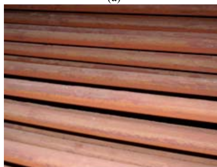
Fig. 1 (a) Schematic illustration of the primary superheater setup and (b) the tube bank

S. Alsaleh is now with the Shyiba Power Plant, Ministry of Electricity and Water, Shyiba, Kuwait