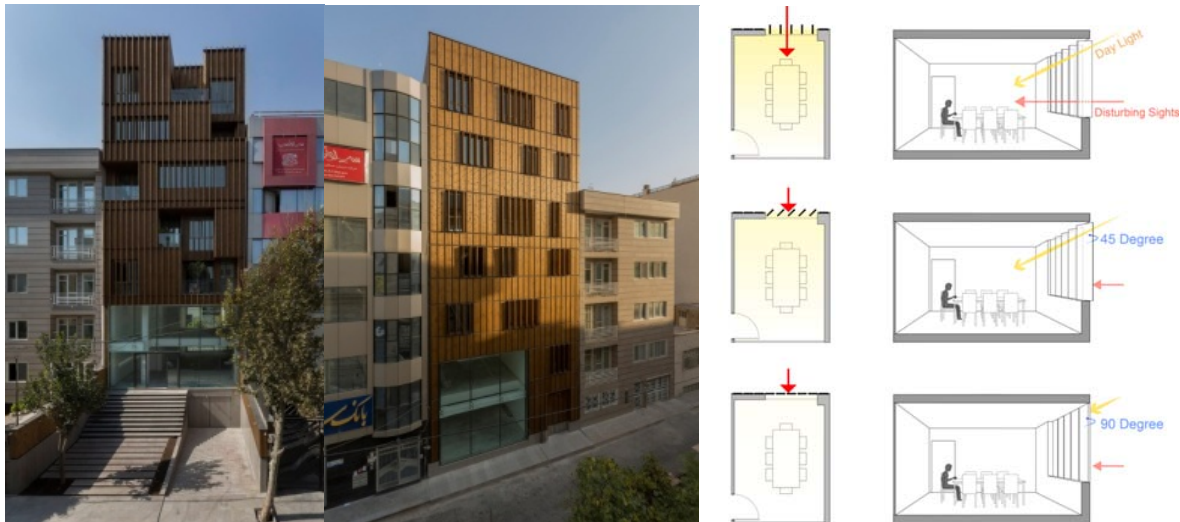
Fig. 7 Saadat Abad Office Building byLP2 Architects [16]