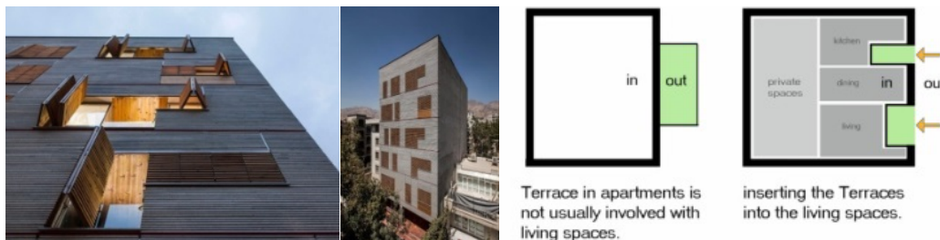
Fig. 2 Andarzgoo Residential Building by Ayeneh Office [11]

In this building, the integration of the terraces into the living spaces together with the utilization of a movable wooden shell was the main design strategies used in the main facade to create comfortable interior spaces while utilising less energy. Moreover, the architects used factory off-cuts of granite for the building's facade, which were laid in strips of varying depths to create a ridged surface; reuse of such waste materials is another sustainability feature in this building.