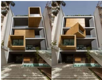
Fig. 3 Sharifi-ha House by Next Office [12]

The main design strategy in this house is the flexibility and transformability of its facade from a two-dimensional facade to a three-dimensional one, which provides a great opportunity for the inhabitants to simply adjust their living environment with the climatic situation of the region to achieve maximum comfort with least amount of energy.