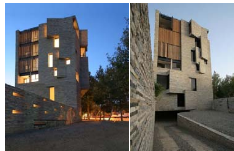
Fig. 4 Apartment No. 1 by AbCT [13]

The main facade of this building is made from a double layer timber, together with panes of stained glass along with planting, that is for aesthetic reason as well as controlling the temperature. Slatted sunshades over the windows can also provide additional control of sunlight. The material used for the large window frames is a type of stone called travertine and their shape assists in reducing heat. The building materials are recyclable and native materials. All these features together would save a considerable amount of energy and enhance the sustainability level of the building.