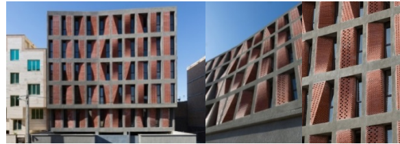
Fig. 1 Kahrizak Residential Building by CAAT Studio [10]

The choice of material is a significant parameter in the sustainability enhancement of this building; because of being locally available, it greatly reduced time, energy, and overall project's cost. Besides that, its arrangement created the high quality interior spaces while minimizing energy consumption.