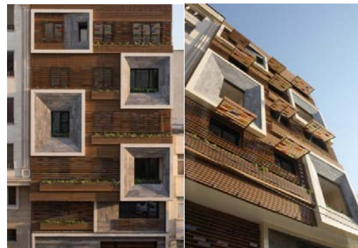
Fig. 5 Orsi-Khaneh by Keivani Architects [14]